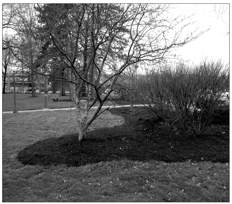
Figure 2. Idea for landscape plantings. Consider planting groups of trees and shrubs in large, mulched planting beds. Such groupings can be attractive and simulate natural conditions.

Many large-balled and burlapped trees are sold with wire baskets securing their root balls. There is debate about whether the wire should be removed at planting. Based on the limited research available, most tree-care professionals recommend removing the top ring of wire. This wire can be removed after the root ball is placed in the planting hole. Because most of the roots of a tree are found within a foot of the soil surface, they tend to grow over the wire. Attempting to remove the entire basket may destroy the root ball.